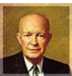
Dwight D. Eisenhower