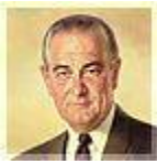
Lyndon B. Johnson