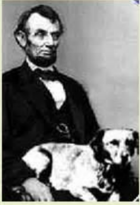
Lincoln and Fido

A day dedicated to celebrating Washington and Lincoln's Birthdays. Here are some unique ways to celebrate.